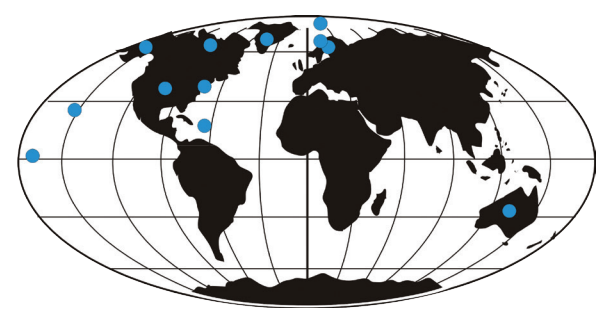
Sounding Rocket launch sites

Approximately 20 missions from sites wordwide are launched annually. Mobile operations enable scientists to conduct research from strategic vantage points. Frequently used launch sites include Poker Flat, Alaska, White Sands Missile Range, New Mexico, Wallops Island, Virginia and Andova, Norway.